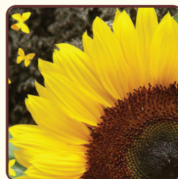
Raster Art - zoomed out

.jpg, .png, .bmp, .gif files are always raster images. We can convert raster images into vector for a fee. Ask your Account Executive for details.