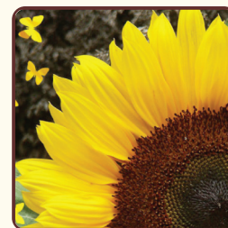
Raster Art - zoomed out