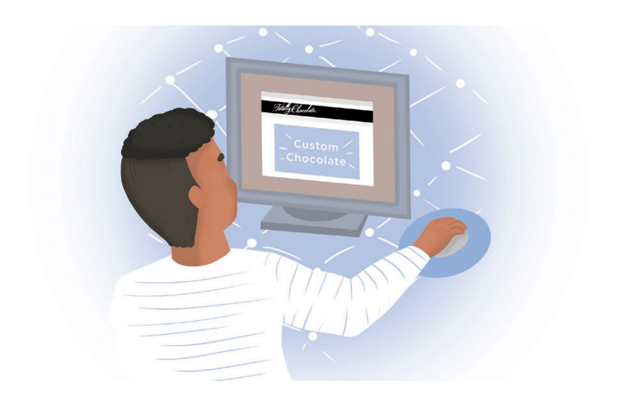
...to help us find more customers that fit...