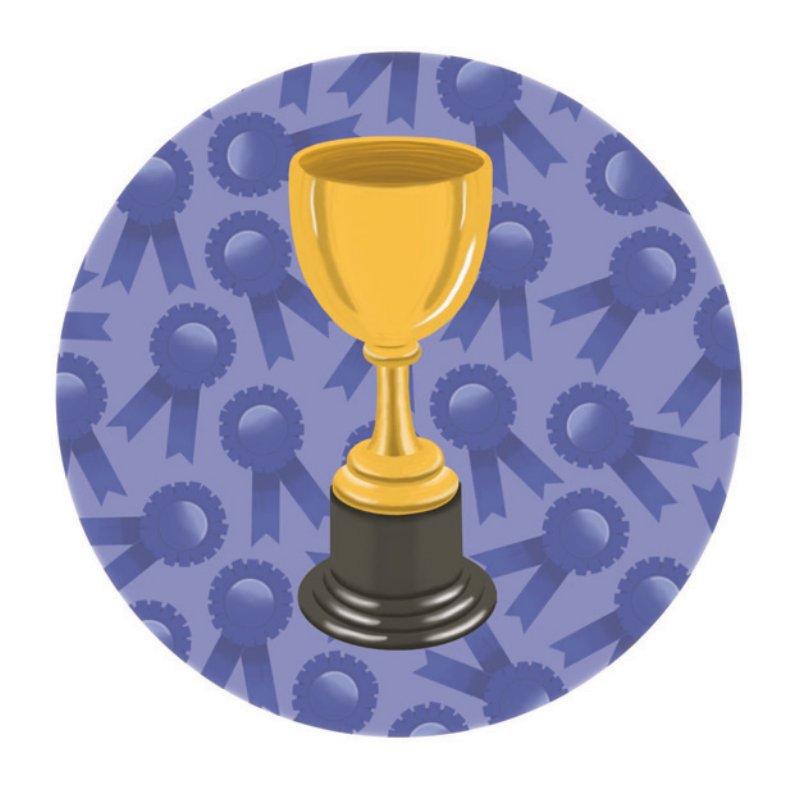
Gaining some fame...