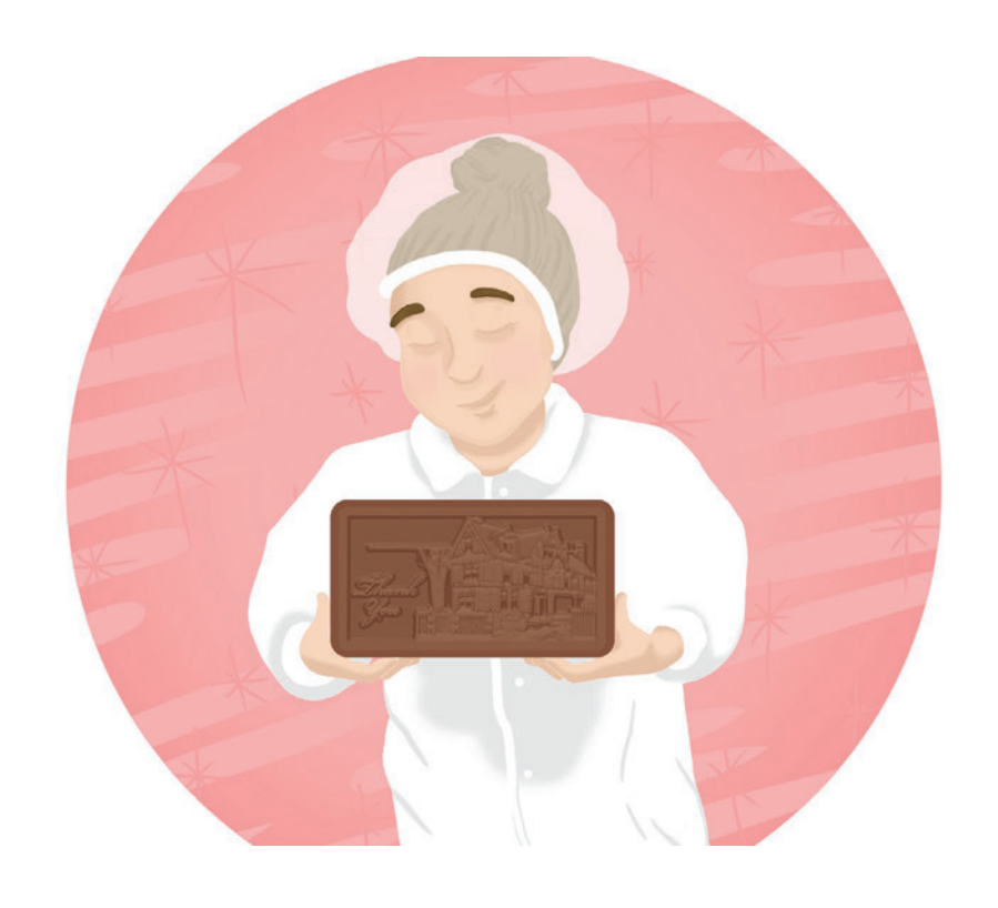
We'll stay true to ourselves and what makes us different