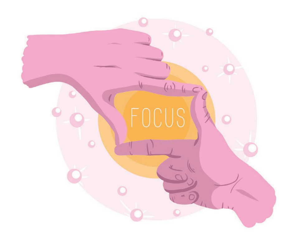
The secret now is staying focused