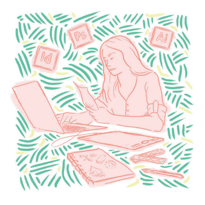
And one-of-a-kind design