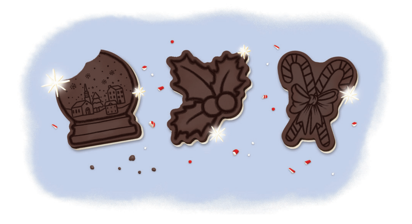
Products that don't just taste great, but look amazing too