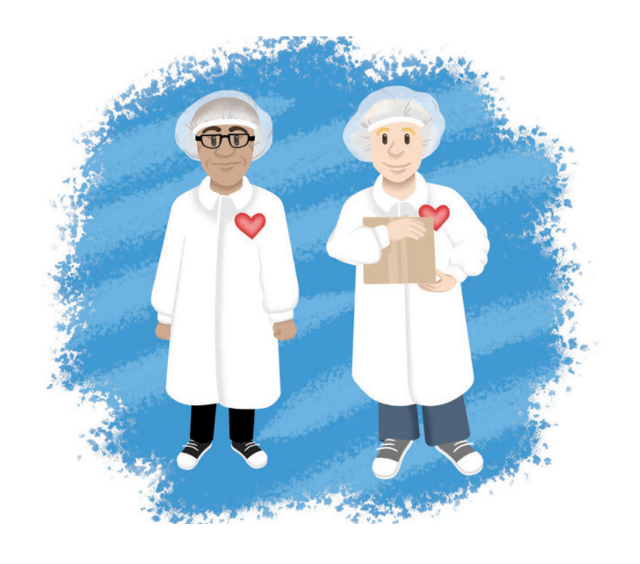
We create products with love and care