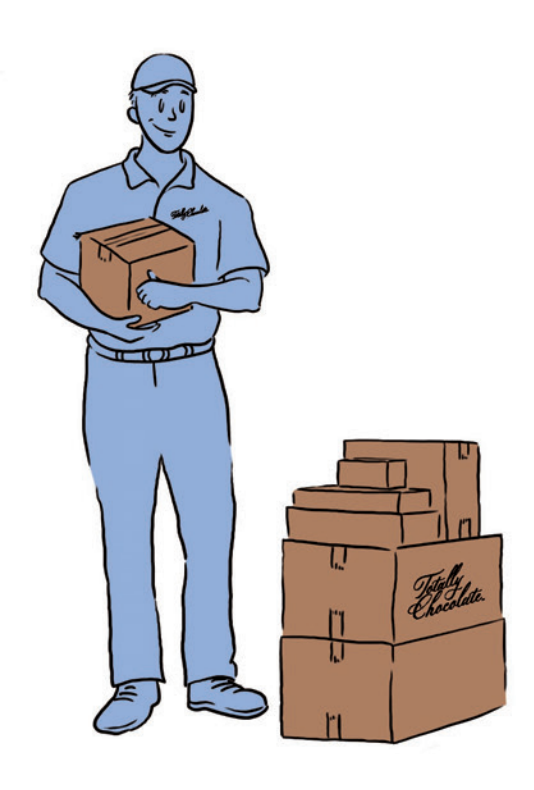
Unmatched service for our customers