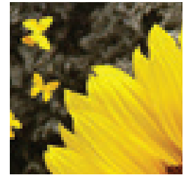
raster art - zoomed in

If you don't have the right file type, ask one of the people listed below.